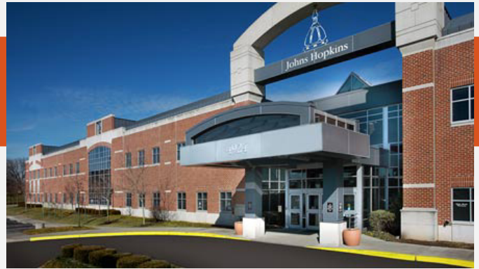
Johns Hopkins Health Care and Surgery Center, White Marsh, MD

To maintain energy savings and ongoing commissioning of the facility systems, GFS provided training for facility engineers on methods to maintain on-going system performance through continuous commissioning processes.